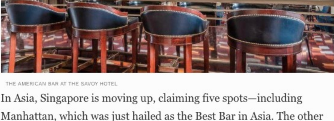
THE AMERICAN BAR AT THE SAVOY HOTEL

Once more, London dominated the World's 50 Best Bars awards with an impressive ten wins. Starting with the American Bar (below) at No. 2, being dethroned by Dandelyan as No. 1, there seemed to be a lot of movement in terms of rankings. The Connaught, for instance, has dropped one spot (from No. 4 in 2017 to No. 5 in 2018). Bar Termini has moved up a few notches to No. 6. And Happiness Forgets dropped steeply (from No. 12 last year to No. 35 this year).